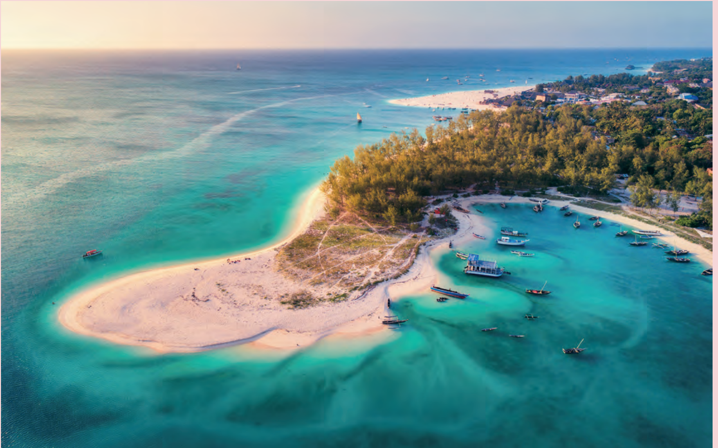
Aerial view of the fishing boats on tropical sea coast, Zanzibar.