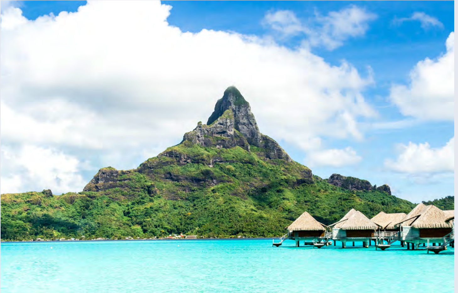
Bora Bora, French Polynesia.