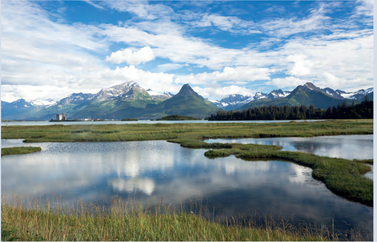
Lakes at Valdez, Alaska.