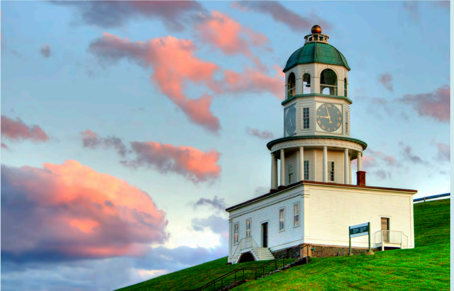
The clock tower on citadel hill, Halifax, Nova Scotia overlooks the Harbour.