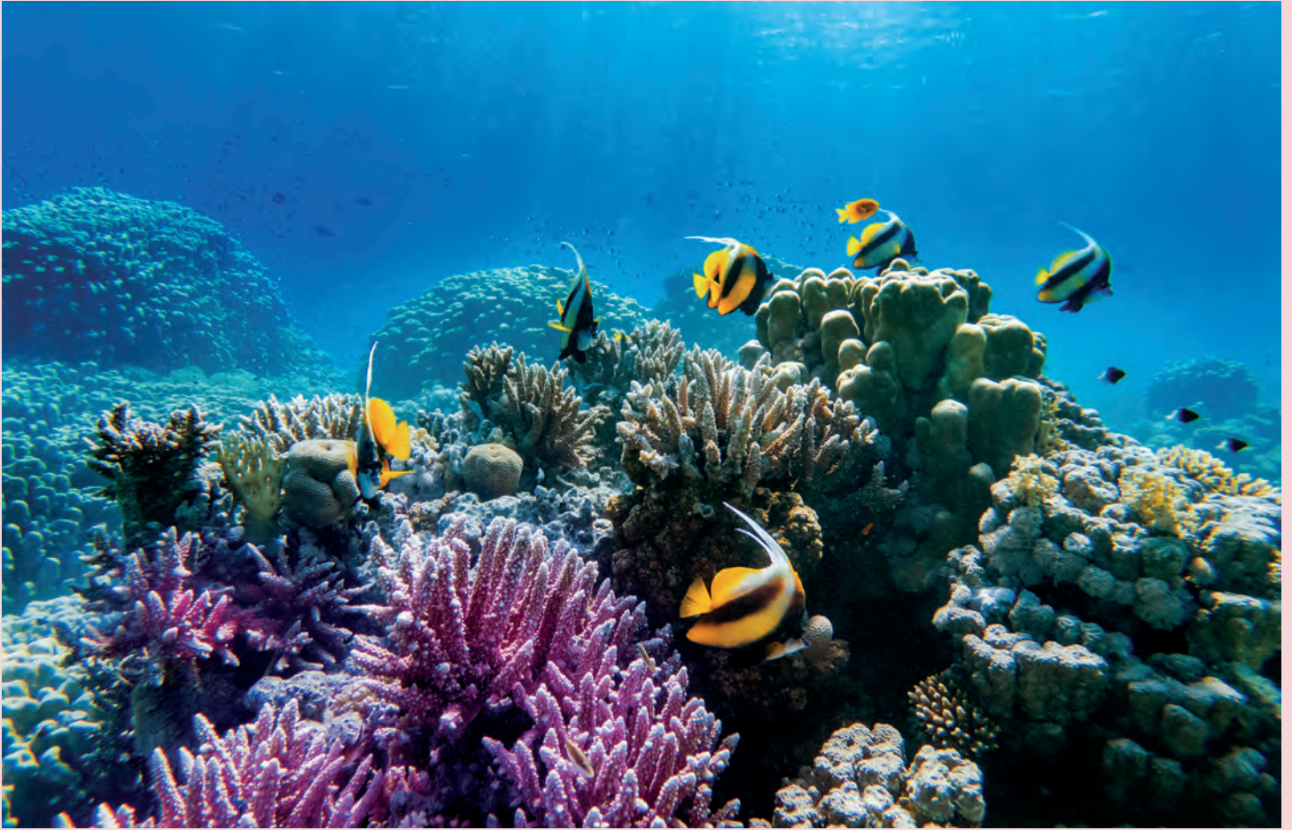
Colorful corals and exotic fishes at the bottom of the Red Sea.