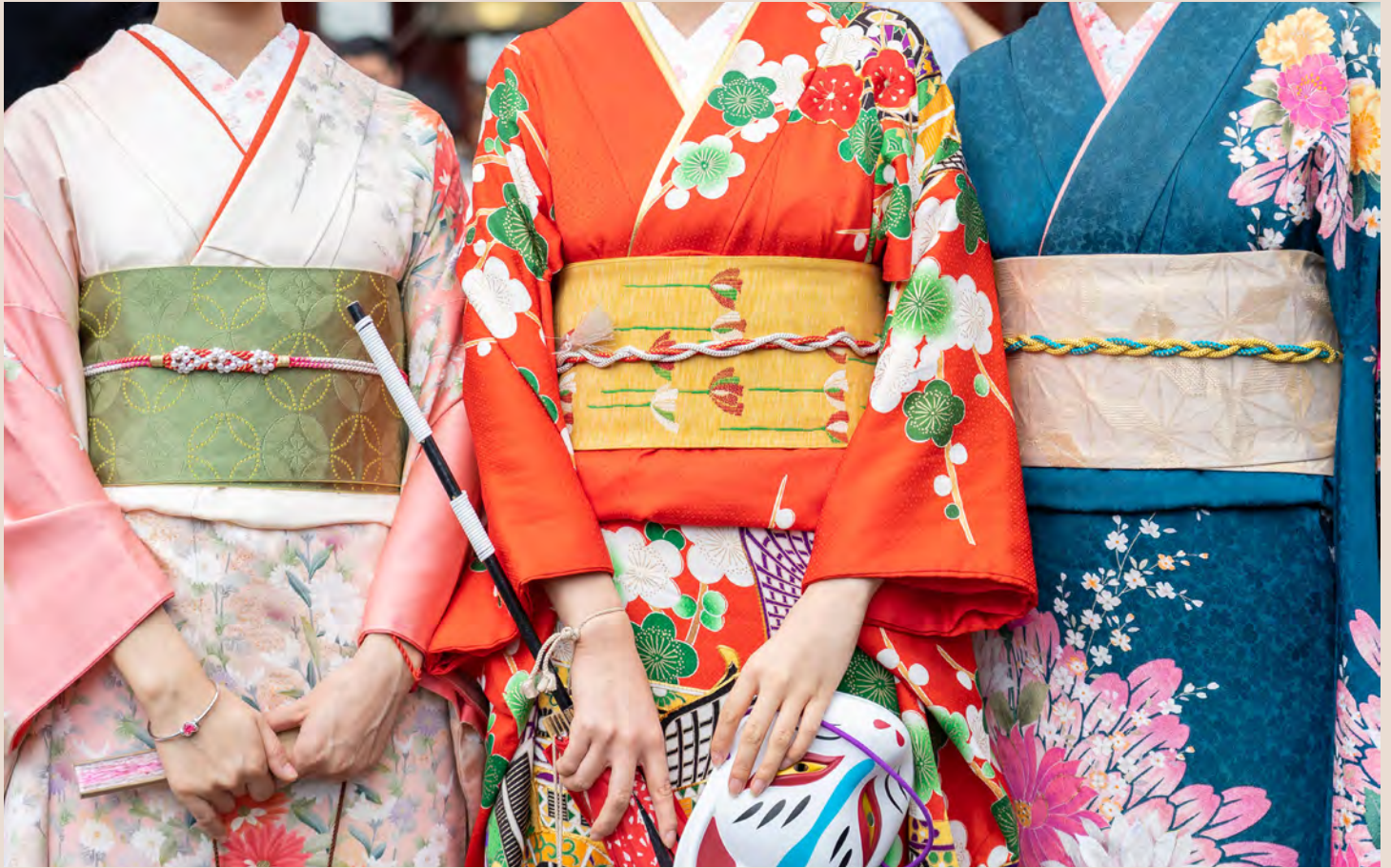
Young girl wearing Japanese kimono standing in front of Sensoji Temple in Tokyo, Japan.