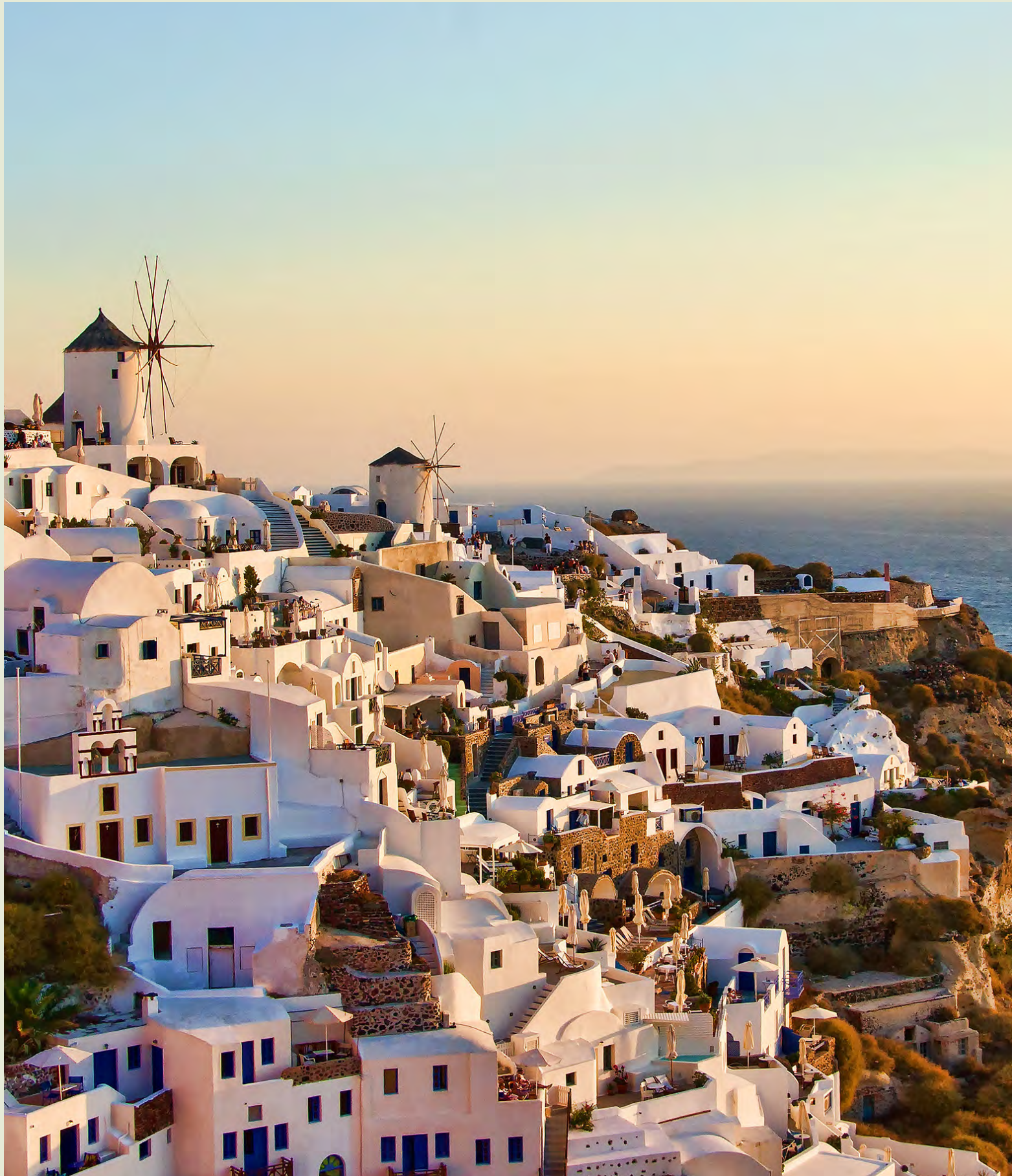
Beautiful landscape at sunset in Oia on Santorini island, Greece.