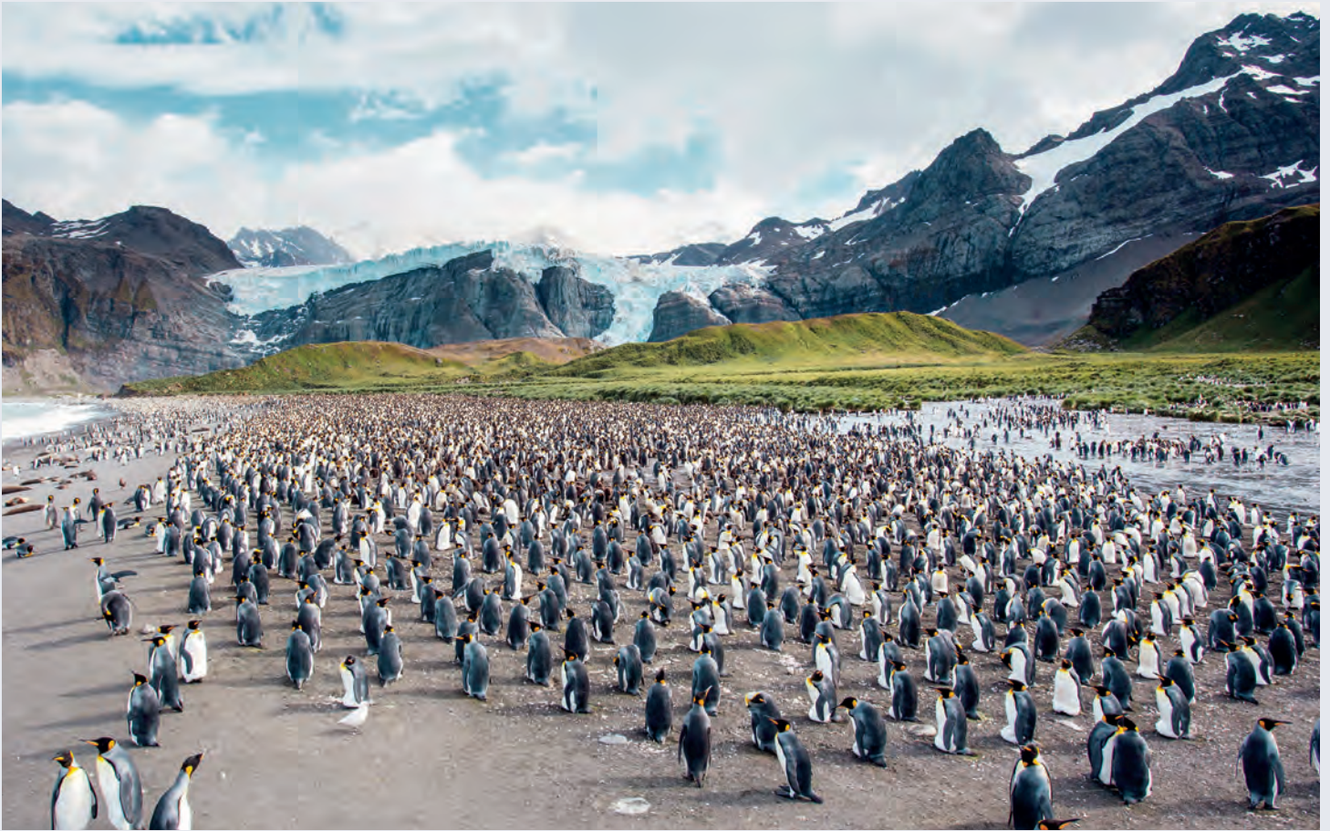
A colony of King Penguins in Gold Harbour, South Georgia.