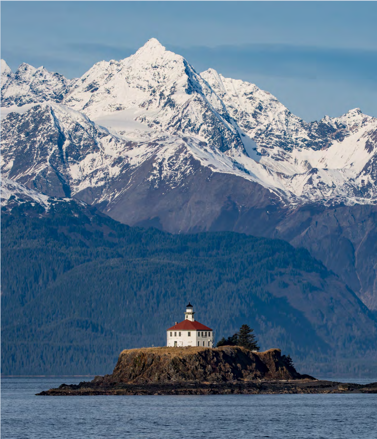
Lynn Canal, Haines, Alaska.