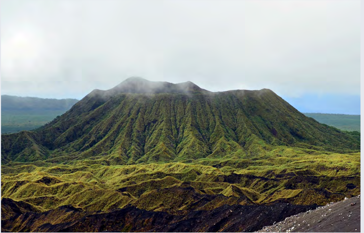
Views from Marum volcano in Ambrym Island, Vanuatu archipelago.