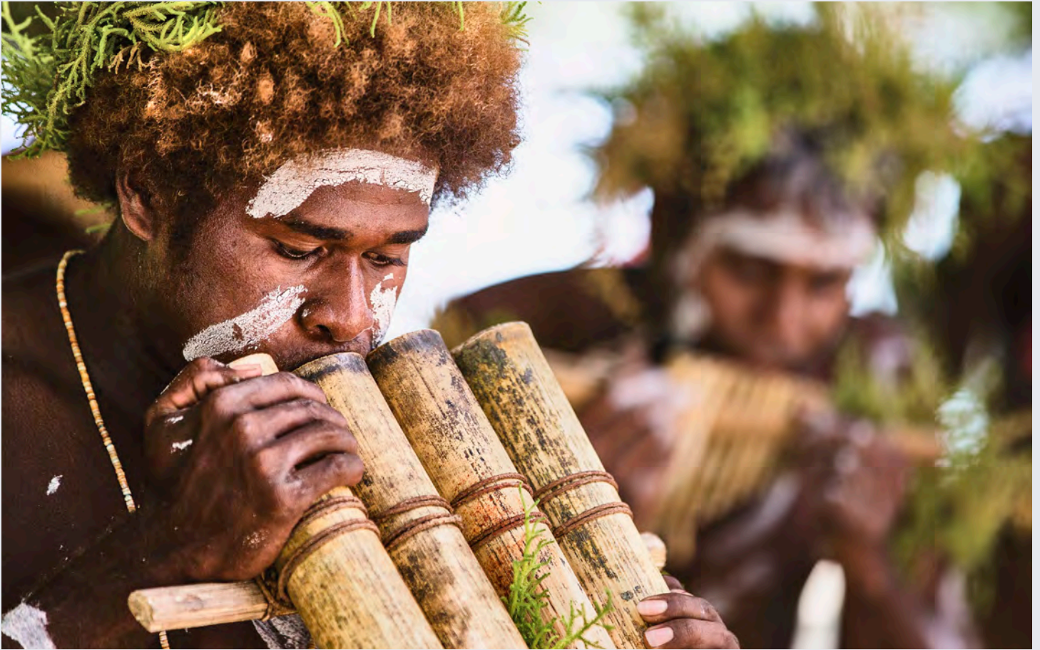
Inhabitants of Mbike Island, playing traditional music, Solomon Islands.