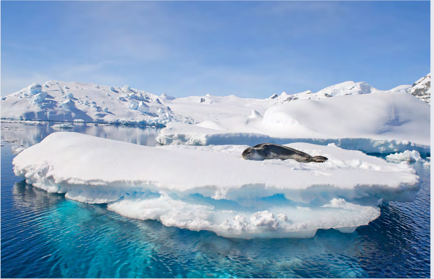
Leopard seal resting on ice in the Antarctic peninsula.