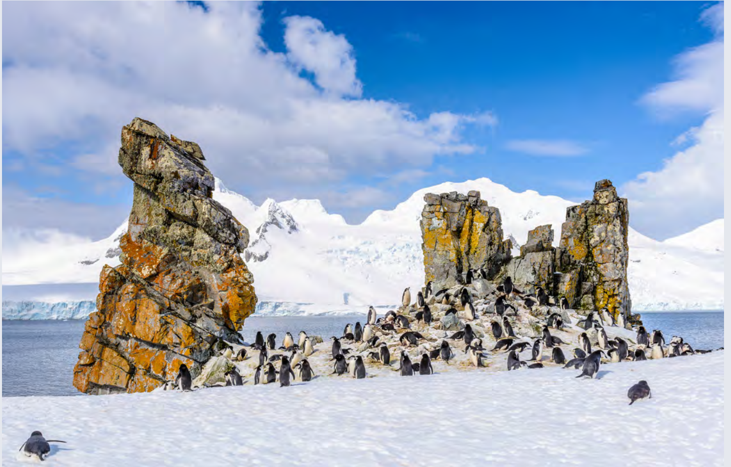
Chinstrap Penguins and a rock in Half Moon Island of the South Shetland Islands.