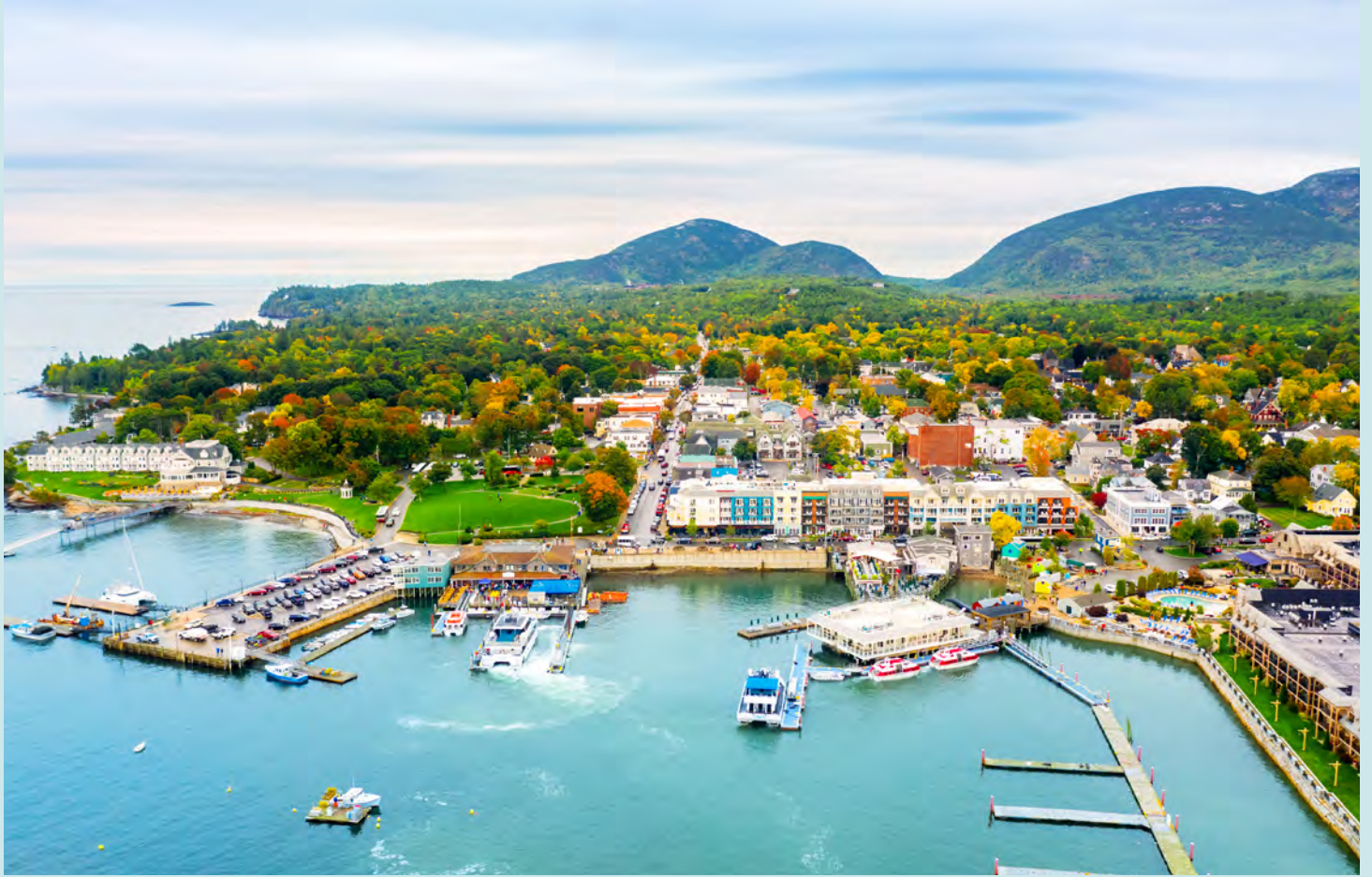
Bar Harbor is a town on Mount Desert Island in Hancock County, Maine.