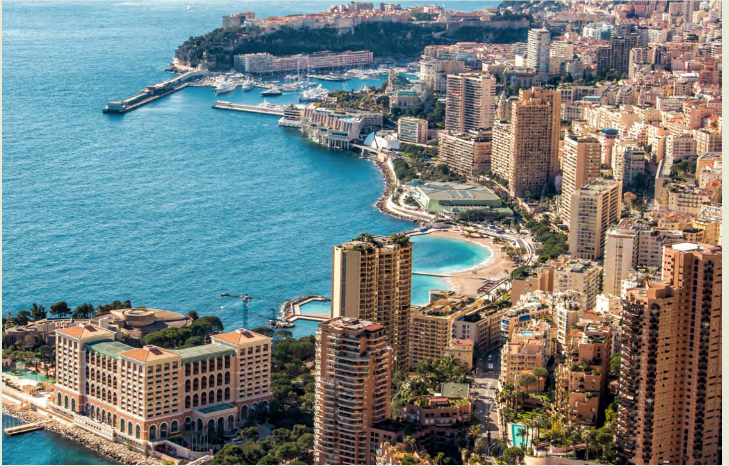
View of Monte Carlo with blue sea, Monaco.