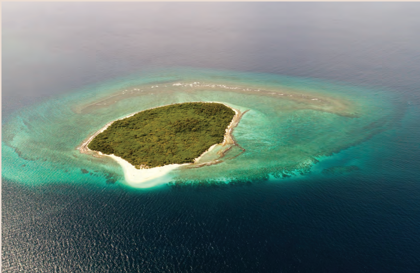
Uligamu islands, Maldives.