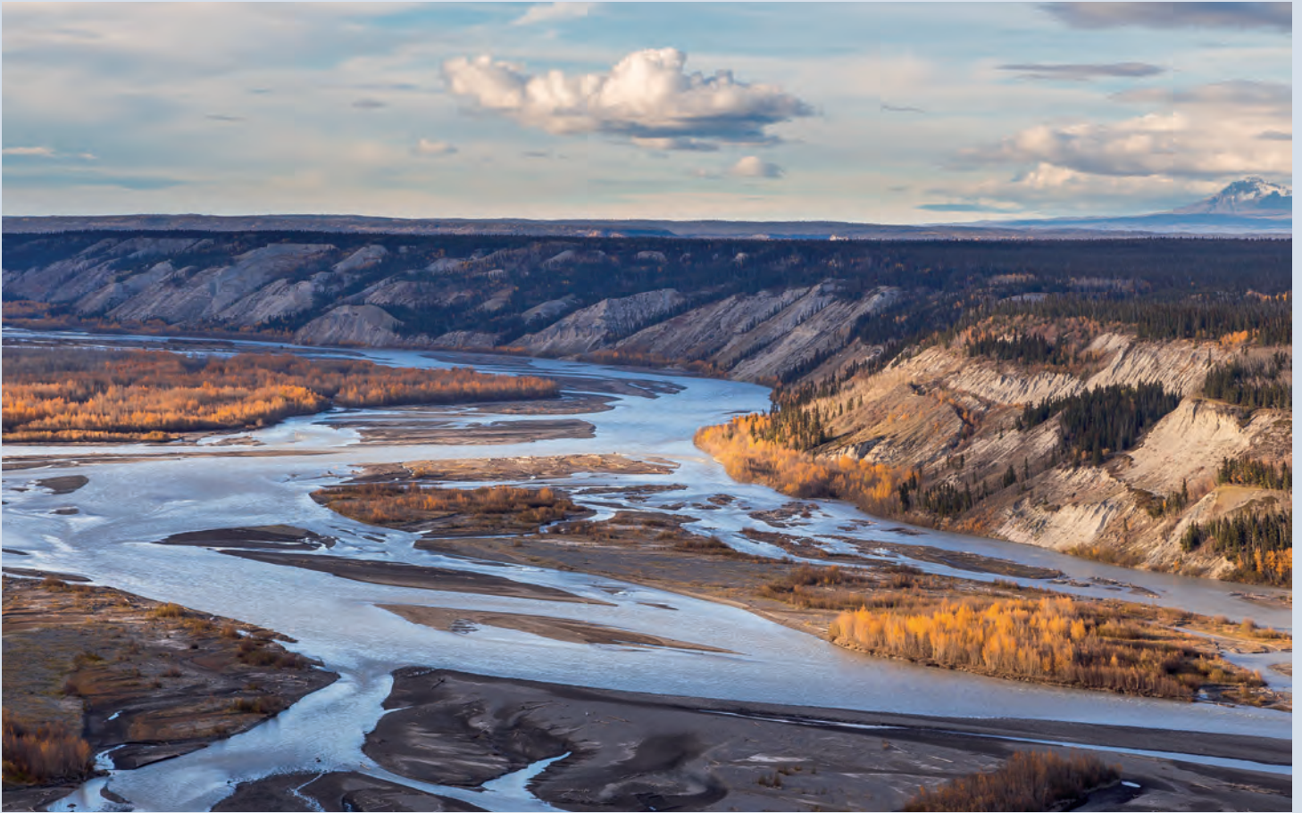
Wrangell-St. Elias National Park and Preserve.