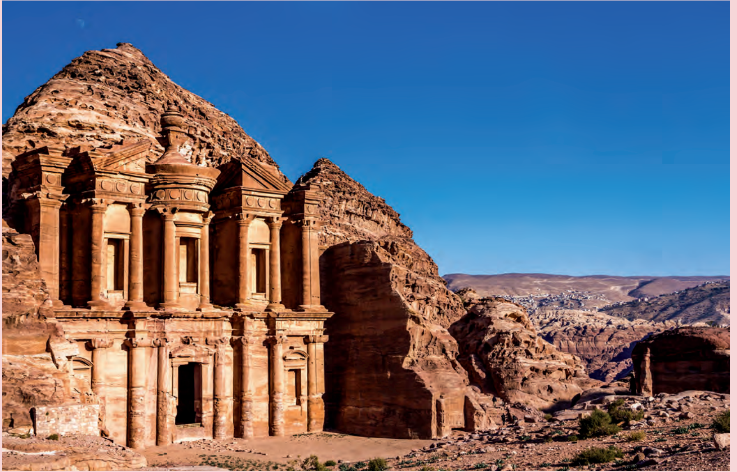
The Monastery - Petra, Jordan.