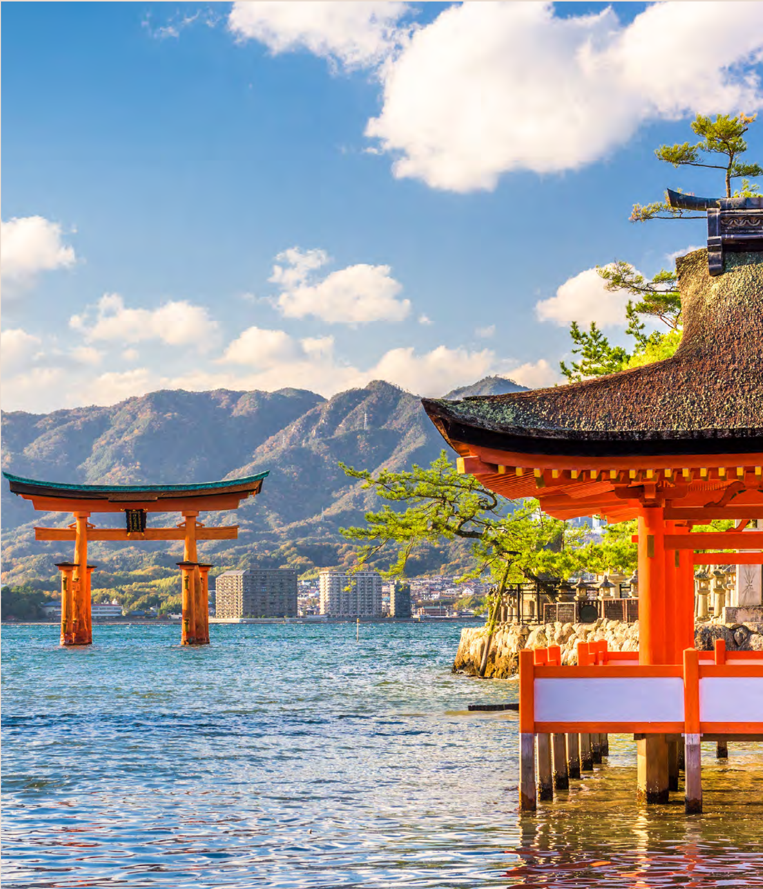
Miyajima, Hiroshima, Japan floating shrine.