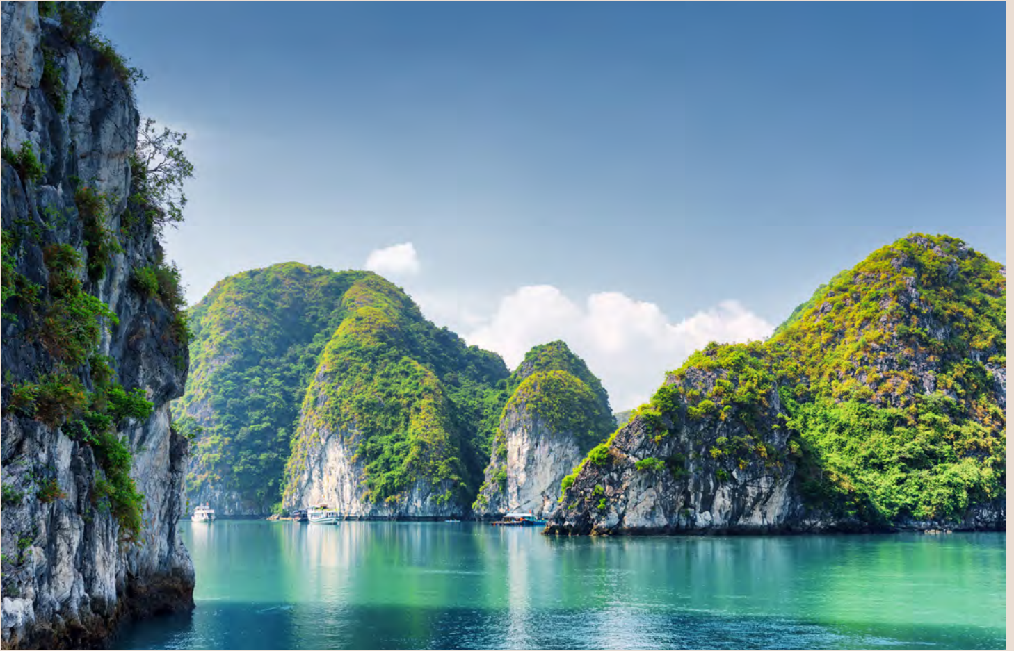
Beautiful azure water of lagoon in the Halong Bay, Vietnam.