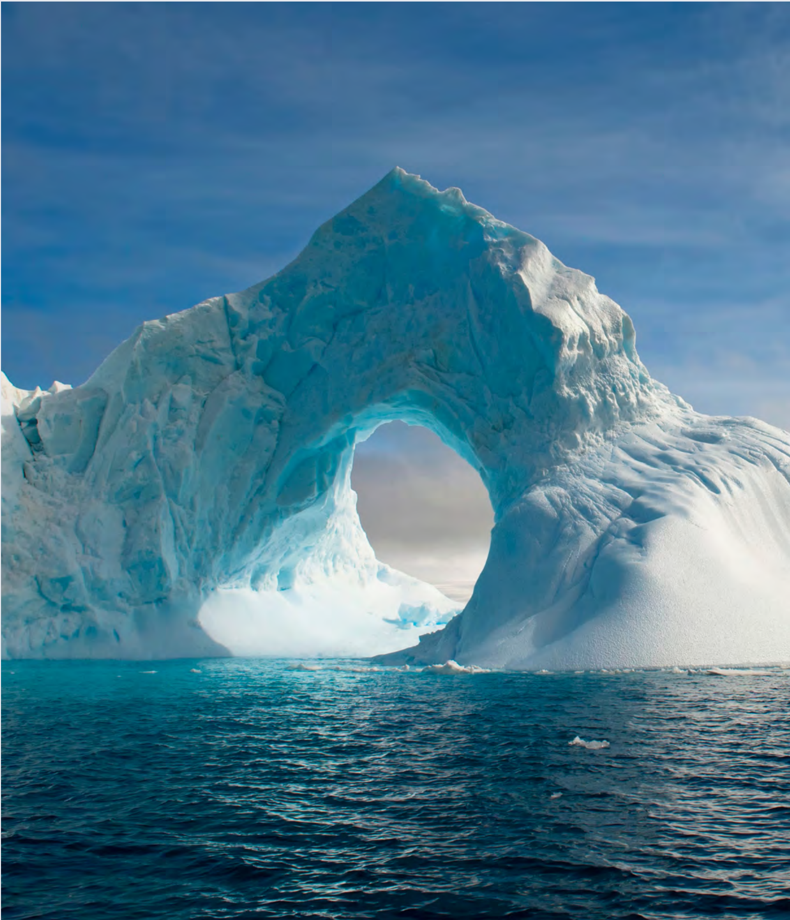
Natural Arch carved in an iceberg, Antarctic Sound, Antarctic Peninsula.