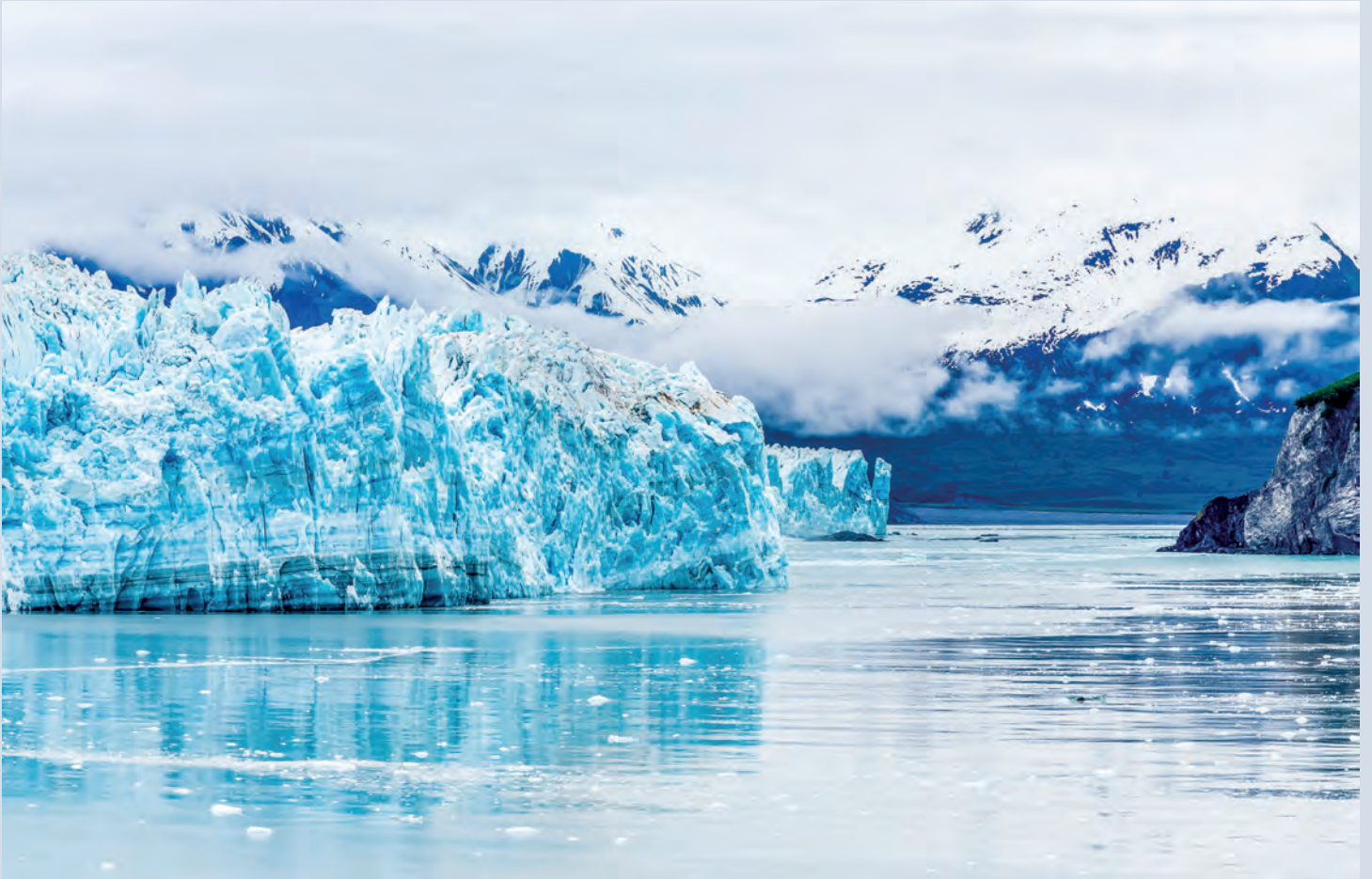
Hubbard Glacier, Alaska.