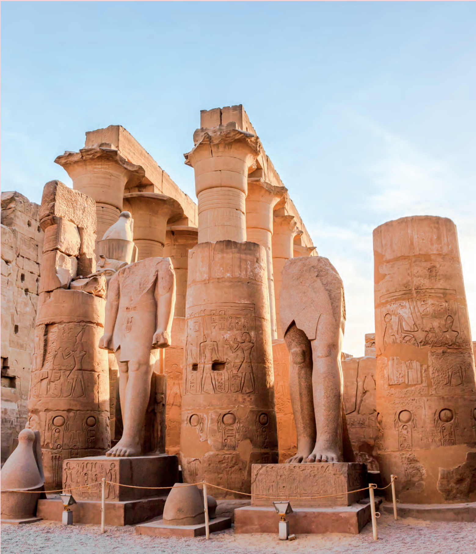
Statue of pharaoh in Luxor Temple, Luxor, Egypt.