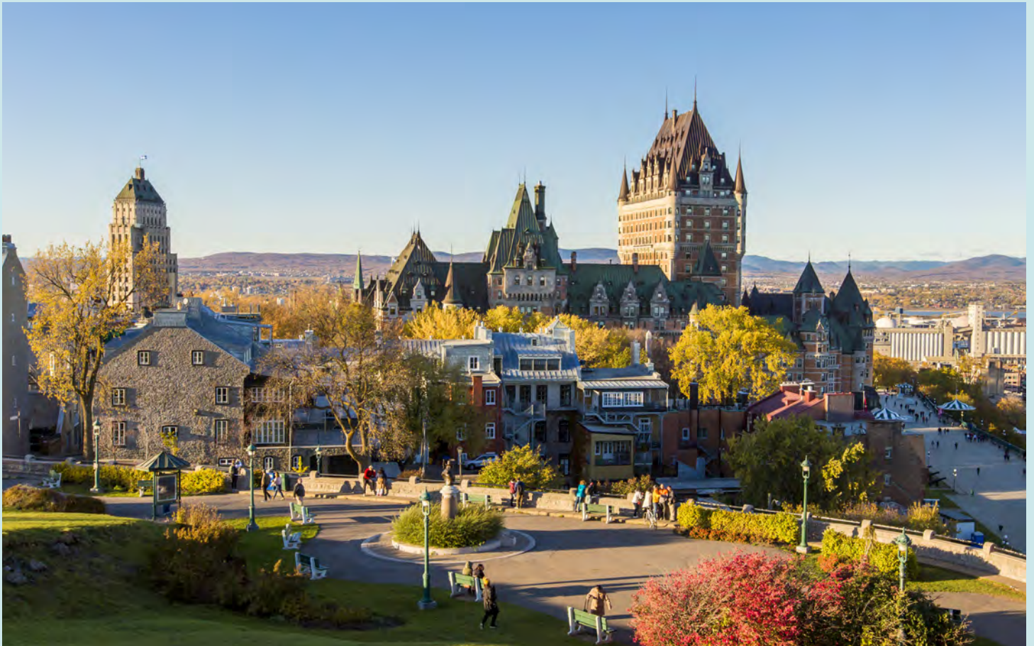
Frontenac Castle in Old Quebec City in the beautiful autumn.