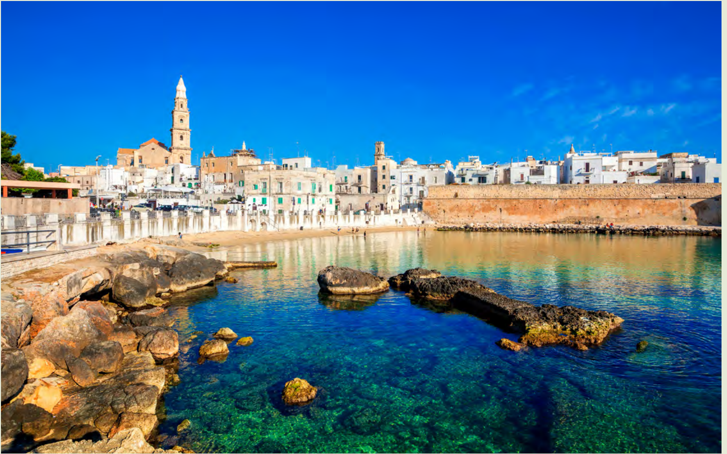
Scenic sight in Monopoli, province of Bari, region of Apulia, southern Italy.