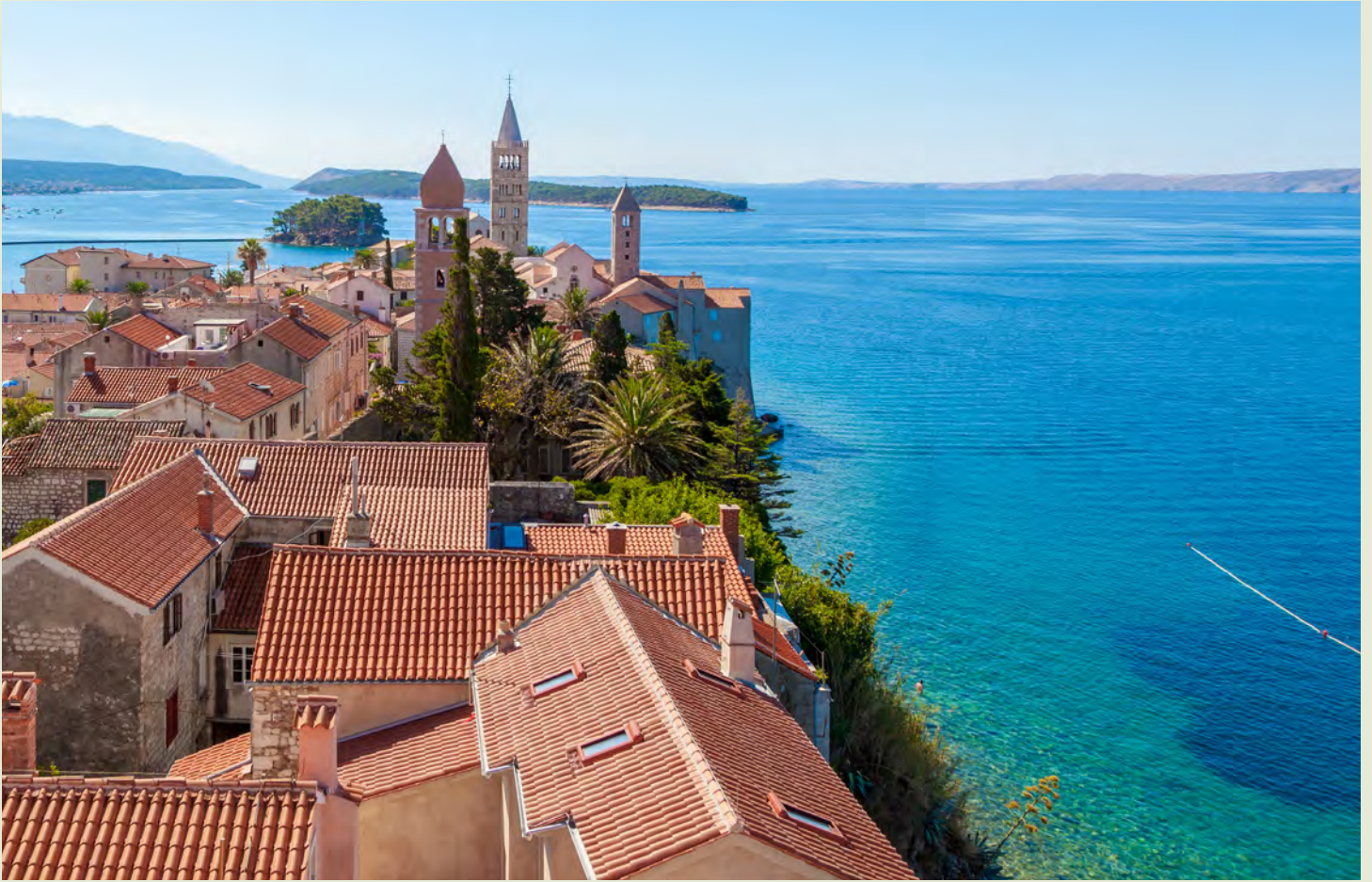
View from Tower in Rab City, Rab Island, Croatia.