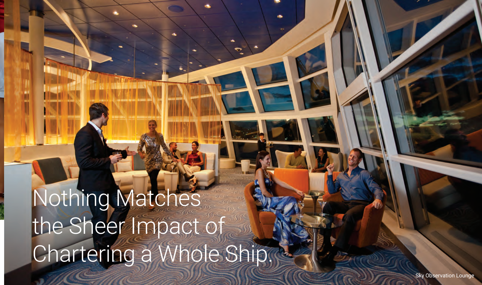
Sky Observation Lounge