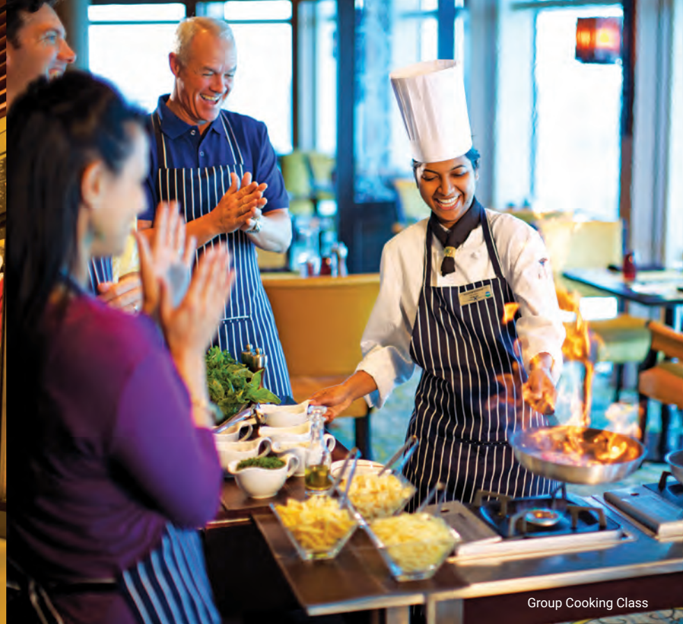
Group Cooking Class

When you share your days with us, we'll fill them with exciting entertainment and engaging activities. Or, you can fill them by doing absolutely nothing at all. The choice is always yours.