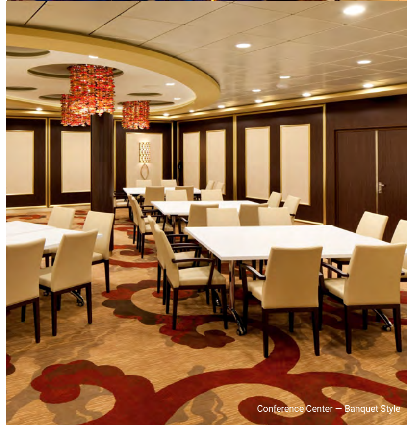
Conference Center — Banquet Style