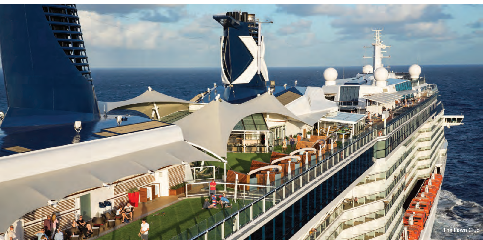
The Lawn Club

More? We can introduce your group to exotic Arabia, Asia, Australia, New Zealand, Pacific islands, South America, even Antarctica.