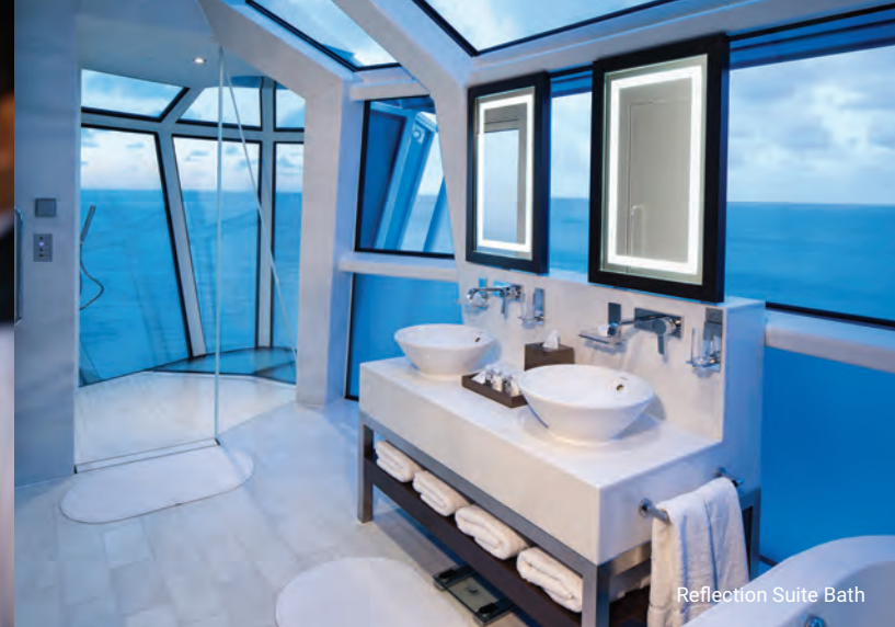
Reflection Suite Bath