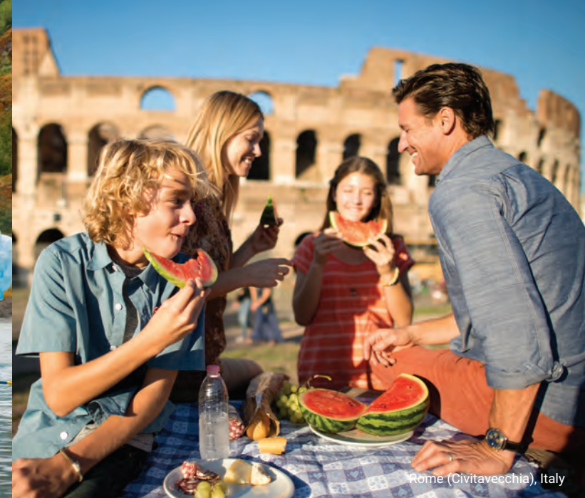
Rome (Civitavecchia), Italy

Tropical Caribbean: You can schedule your event in the morning, then soak up some golden sunshine and turquoise waters in the afternoon. Watch dolphins play. Snorkel vibrant reefs. Stroll endless beaches. Five ships sail there—including Celebrity Equinox SM all year.