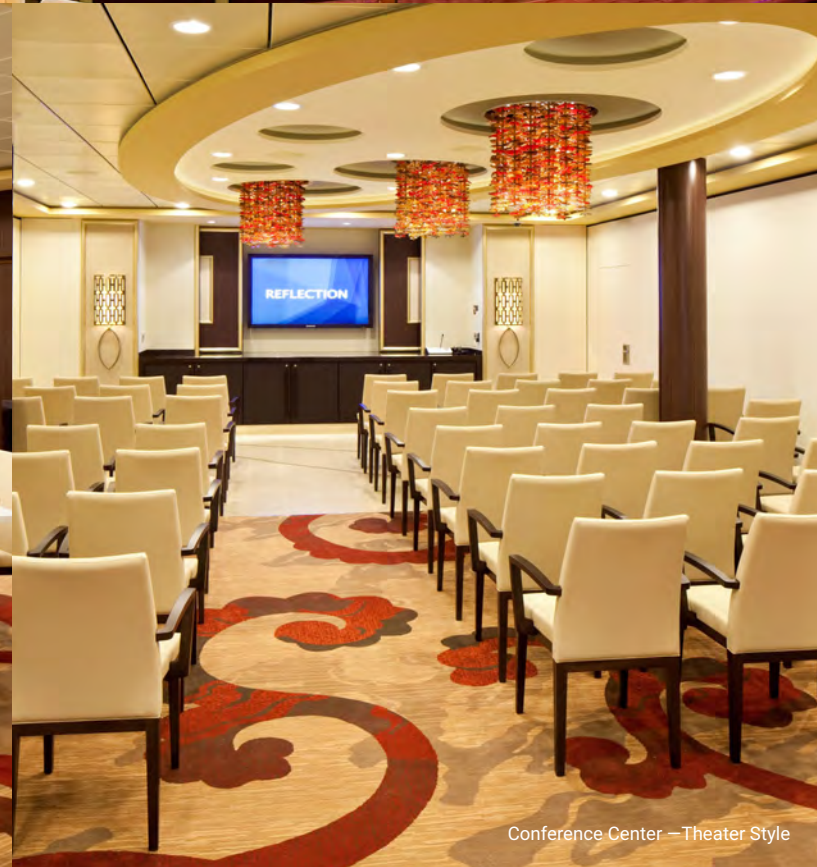
Conference Center — Theater Style