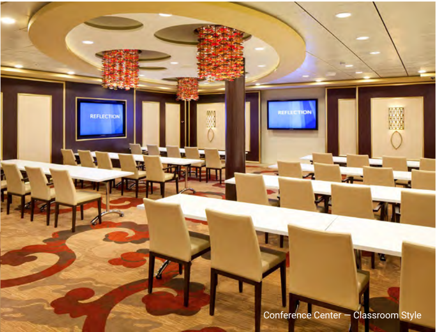
Conference Center — Classroom Style

Could an exclusive venue be any more inclusive?