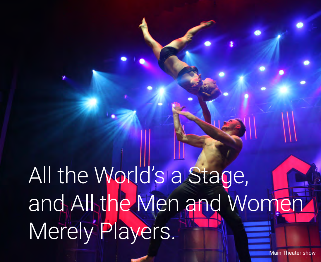
Main Theater show