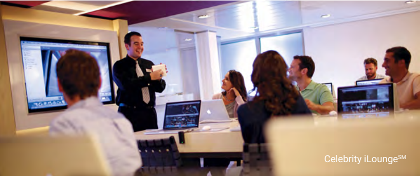
Celebrity iLounge SM