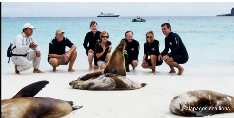
Galapagos sea lions